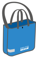
Tote bag carried by enumerators (sample)

Enumerators carry an Enumerator Identification Card to verify their identity.