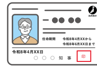
Enumerator Identification Card (sample)